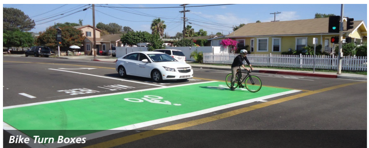
Bike Turn Boxes