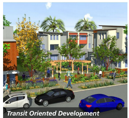
Transit Oriented Development