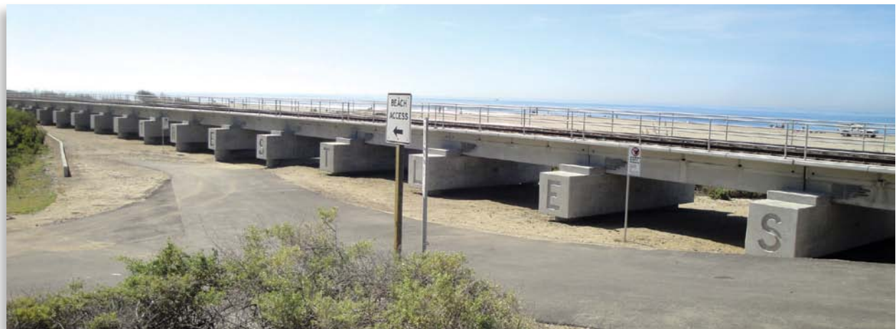
San Mateo Creek Bridge at Trestles Beach - completed March 2012