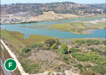
San Elijo Lagoon Restoration and Environmental Enhancements