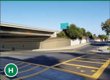
Chestnut Avenue Community Enhancements