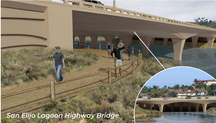
San Elijo Lagoon Highway Bridge

The San Elijo Lagoon highway bridge will be replaced to accommodate new Carpool/HOV Lanes along I-5. The new bridge will be lengthened to improve tidal flows, circulation, and the overall health of the lagoon. In addition, a suspended bike and pedestrian bridge will be built underneath the highway bridge to further increase north-south and east-west connectivity, and create more travel choices. The North Coast Bike Trail will be constructed to expand the regional bike and pedestrian network.