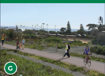
Coastal Rail Trail Bikepath