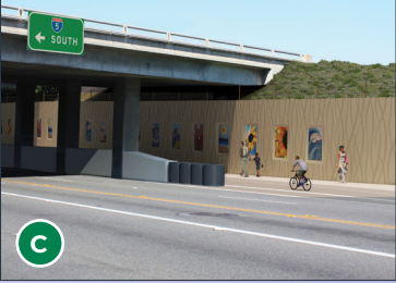
Encinitas Blvd./Santa Fe Dr. Bike/Pedestrian Enhancements