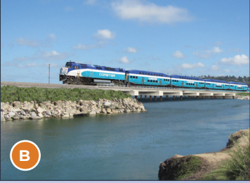
San Elijo Lagoon Double Track