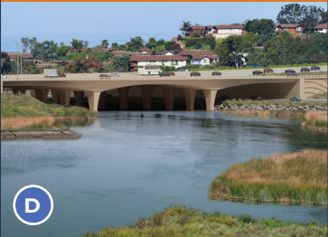
San Elijo Lagoon Bridge Replacements*