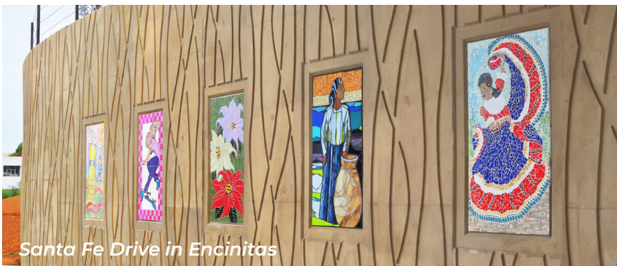
Santa Fe Drive in Encinitas

Separated bike and pedestrian paths were constructed at the I-5 interchanges at Santa Fe Drive and Encinitas Boulevard in Encinitas. These enhancements help improve east-west connectivity and safety for people walking and biking to nearby schools, activity centers, and coastal resources. Community artwork was incorporated in coordination with the city.