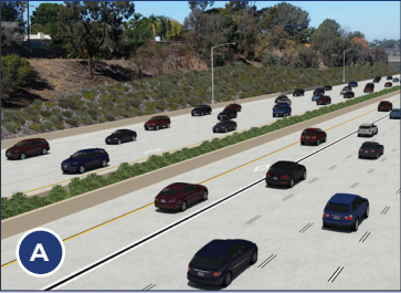
New Carpool/HOV Lanes from Lomas Santa Fe Dr. to SR 78