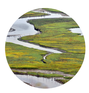
Protect existing native species through the strategic acquisition, management, and monitoring of critical habitat areas identified in regional habitat conservation plans.

Our vision for habitat conservation is to: Protect, Connect and Respect.