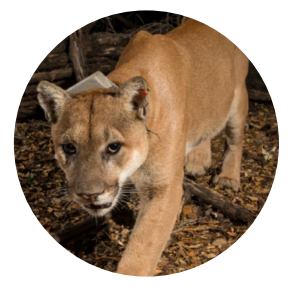
Connect habitat areas through wildlife corridors and linkages, as well as connecting people to local species and natural habitats.