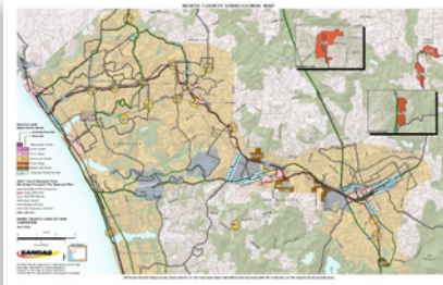
North County Subregional Map