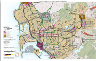
Mid-City and East County Subregional Map