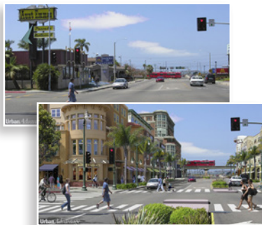
Visualizing smart growth possibilities... Existing conditions in Chula Vista (above); Conceptual opportunities (below)