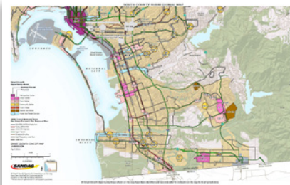
South County Subregional Map