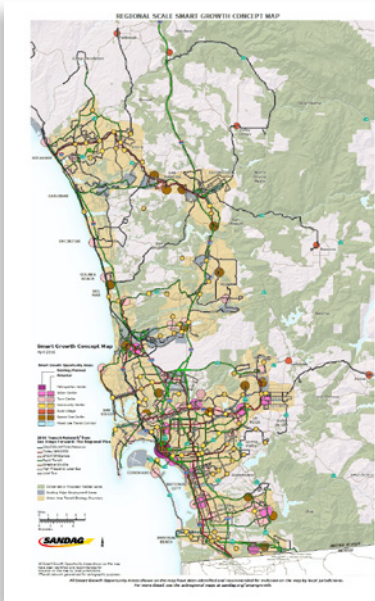
Regional Scale Smart Growth Concept Map