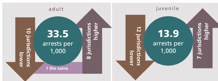
Figure 2 Adult and juvenile arrest rates per 1,000 resident population in 2017

The region's 2017 juvenile arrest rate per 1,000 resident population was 13.9, with a range from 8.8 (in Oceanside) to 20.9 (in Escondido).